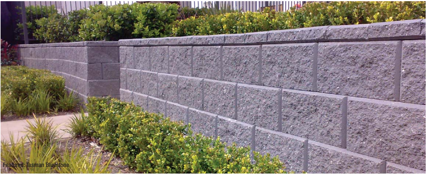
Featured: Tasman Bluestone

SELKIRK'S RETAINING WALL SYSTEMS ARE THE SMART, SIMPLE AND AFFORDABLE WAY TO BRING YOUR OUTDOOR AREA TO LIFE.